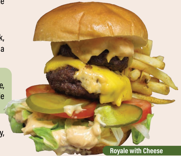
Royale with Cheese

Grilled patty topped with bacon, BBQ sauce, Pepper Jack, melted queso, Onion Jam, French fries, dressed with combo sauce on a Brioche bun. 14.99