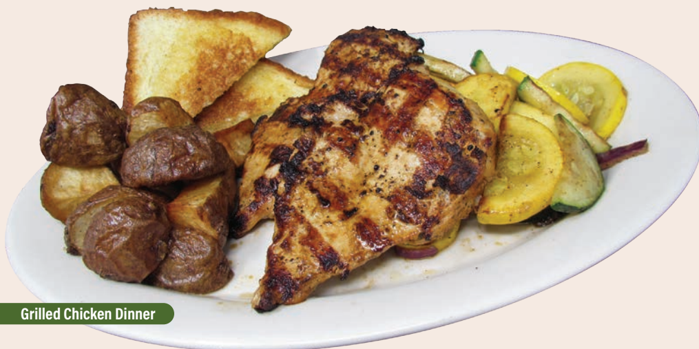
Grilled Chicken Dinner

Our thick (grilled or paneed) pork ribeye, served with mixed veggies and roasted potatoes. 14.99