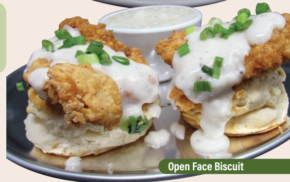
Open Face Biscuit