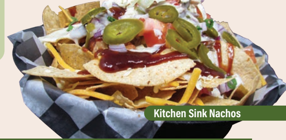
Kitchen Sink Nachos

SIDE ITEMS REGULAR: (3.99 each) French Fries | Coleslaw | Roasted Potatoes | Fruit Cup