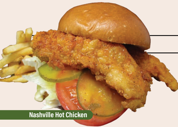
Nashville Hot Chicken