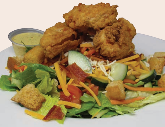
Honey Bee Chicken Salad

Spinach, jerk chicken, red onion, tomato, carrot, cucumber, grapes, croutons, blue cheese crumbles & pepper jelly vinaigrette. 12.99