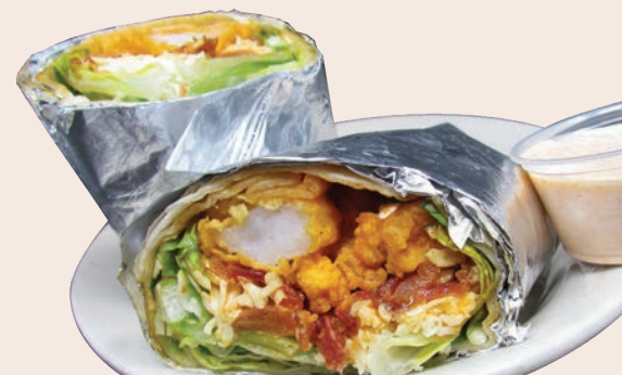
Fried Reaper Shrimp Wrap

Fried Gulf shrimp tossed in Reaper sauce, bacon, Pepper Jack, Swiss, tomato, Romaine mix, & Reaper Ranch on the side. 13.99